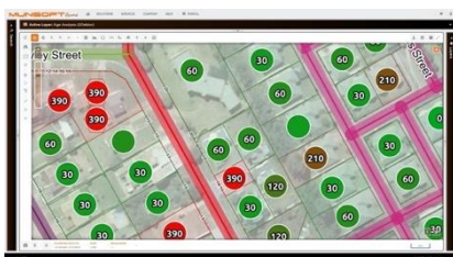
Debtors' age analysis as represented on the map, allowing users to identify trends, patterns and focus areas for debt collection and credit control purposes.