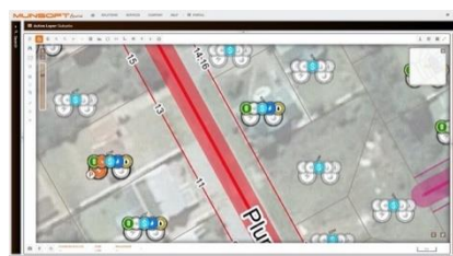
Property rates and service charges billed per stand to identify anomalies.